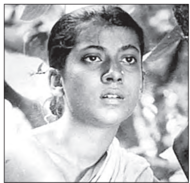
পথের পাঁচালীর দুর্গা

পড়ছে। তখন আমার বয়স ৯, দিদির ১৪। সেই বাসে গুটিং কী, তাই-ই বুঝতাম না। একসঙ্গে দু'জনে গুটিং করছি। গুটিয়ার বোতলে গুটি। ট্রেন দেখতে যাওয়ার দৃশ্যের গুটিং হয়েছিল শক্তিশালী কাছের পালিস্টে।