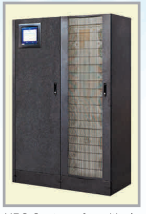
UPS Systems for critical operation